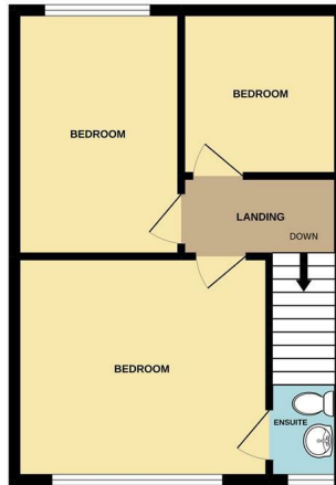
1ST FLOOR 388 sq. ft. (36.0 sq.m.) approx.